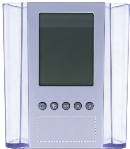
1. BELOW DISPLAY